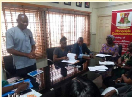
Advocacy Visit to Oyo State Min. of Women Affairs, Social Welfare, Poverty Alleviation & Community Development – April 2, 2019