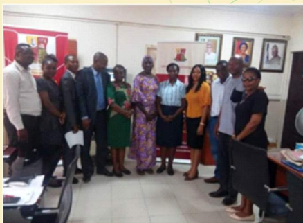
Group Photograph of Management Team of Min. of Women Affairs and CS-SUNN Advocacy Team