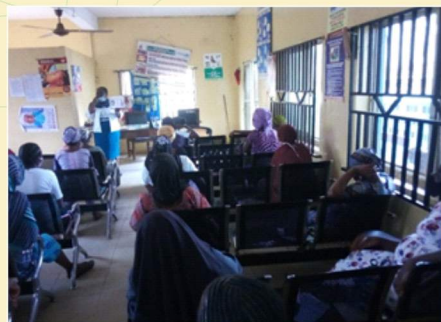
CS-SUNN Deputy coordinator presenting Nutrition Education to pregnant women in Oniyarin health centre, Oniyarin Ibadan