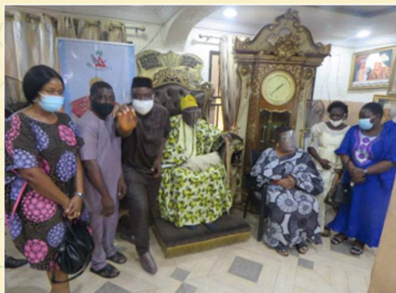
Advocacy visit to Imperial majesty, Olubadan of Ibadan