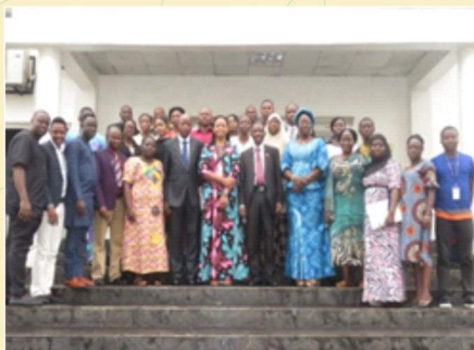
Participants group photograph with Honourable Commissioner of Health, after the Stakeholder meeting