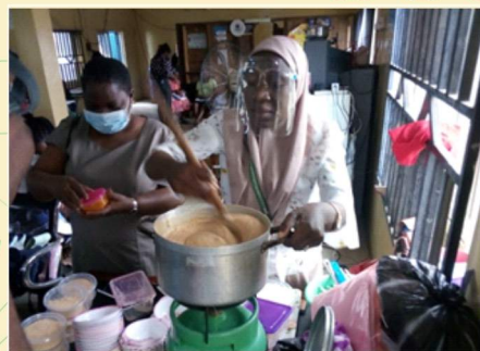
Food preparation during food demonstration among nursing mothers in Oniyarin health centre